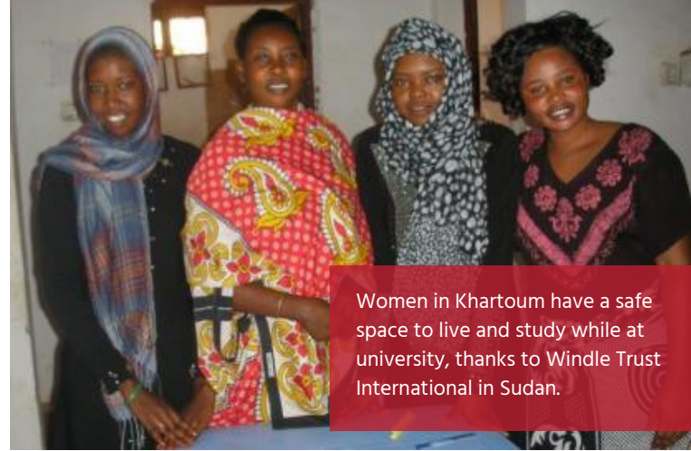
Women in Khartoum have a safe space to live and study while at university, thanks to Windle Trust International in Sudan.

Offering to match employee donations is an effective way of demonstrating your commitment to positive change and can help to improve employee loyalty to your business.