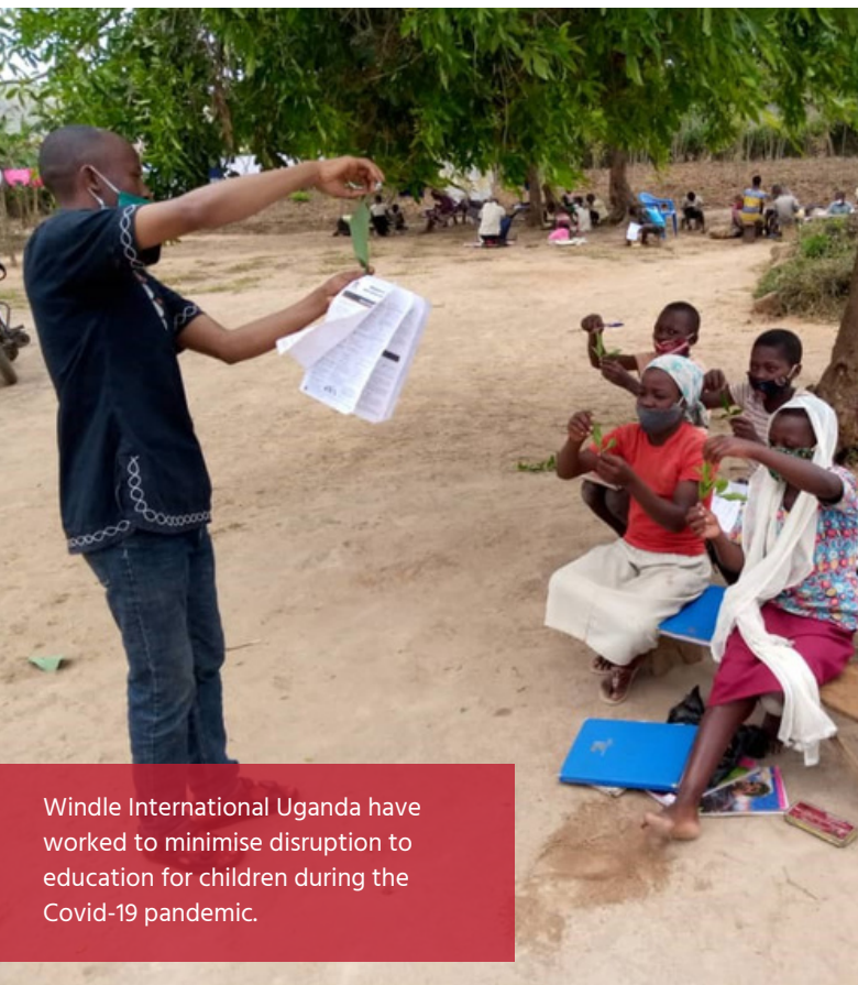
Windle International Uganda have worked to minimise disruption to education for children during the Covid-19 pandemic.

We can offer tailored volunteering opportunities for your employees that will have a direct impact for children and young people affected by conflict. We're happy to work with you on developing a bespoke programme that matches your goals and your employees' skills.